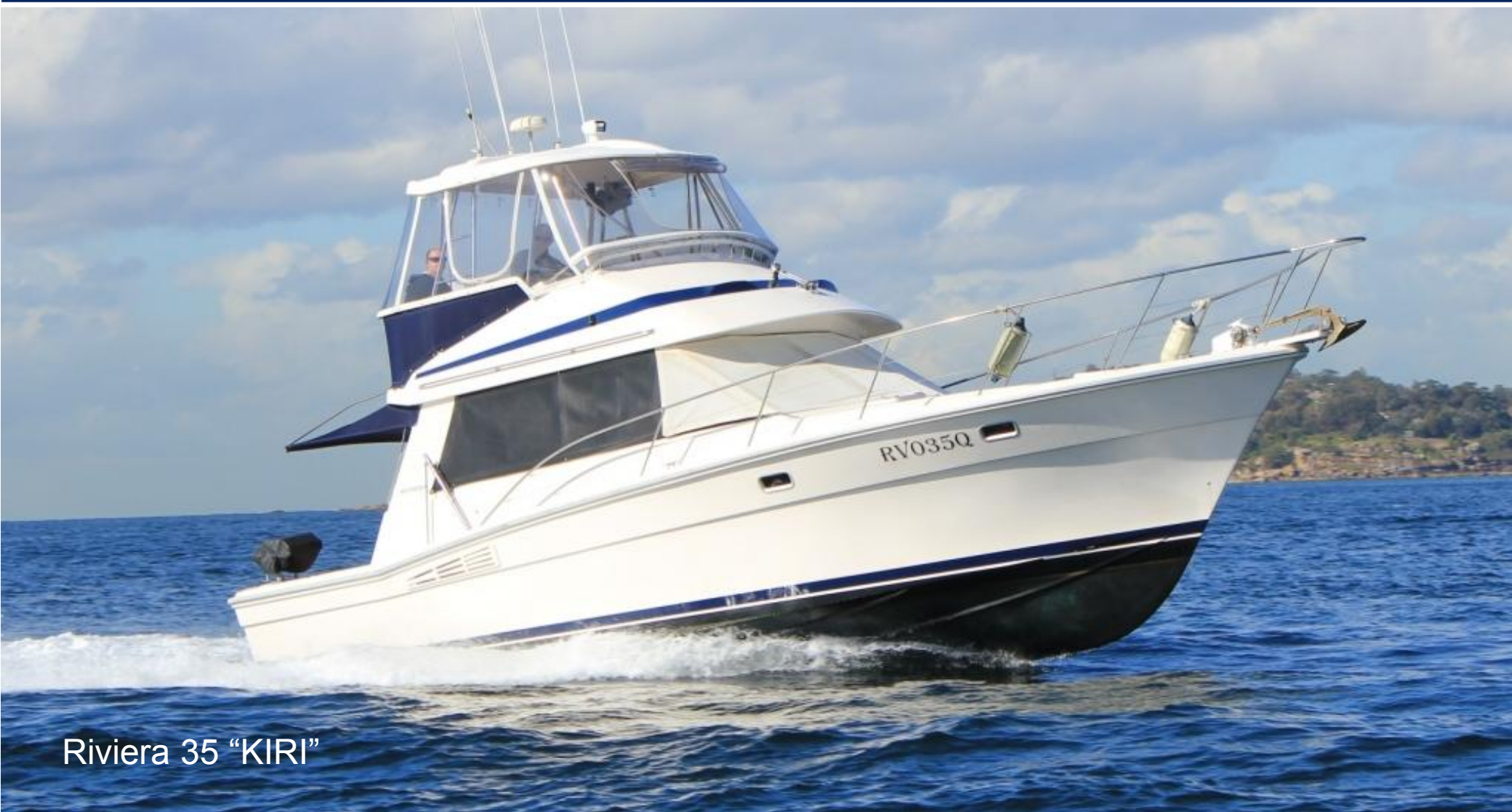
Riviera 35 "KIRI"