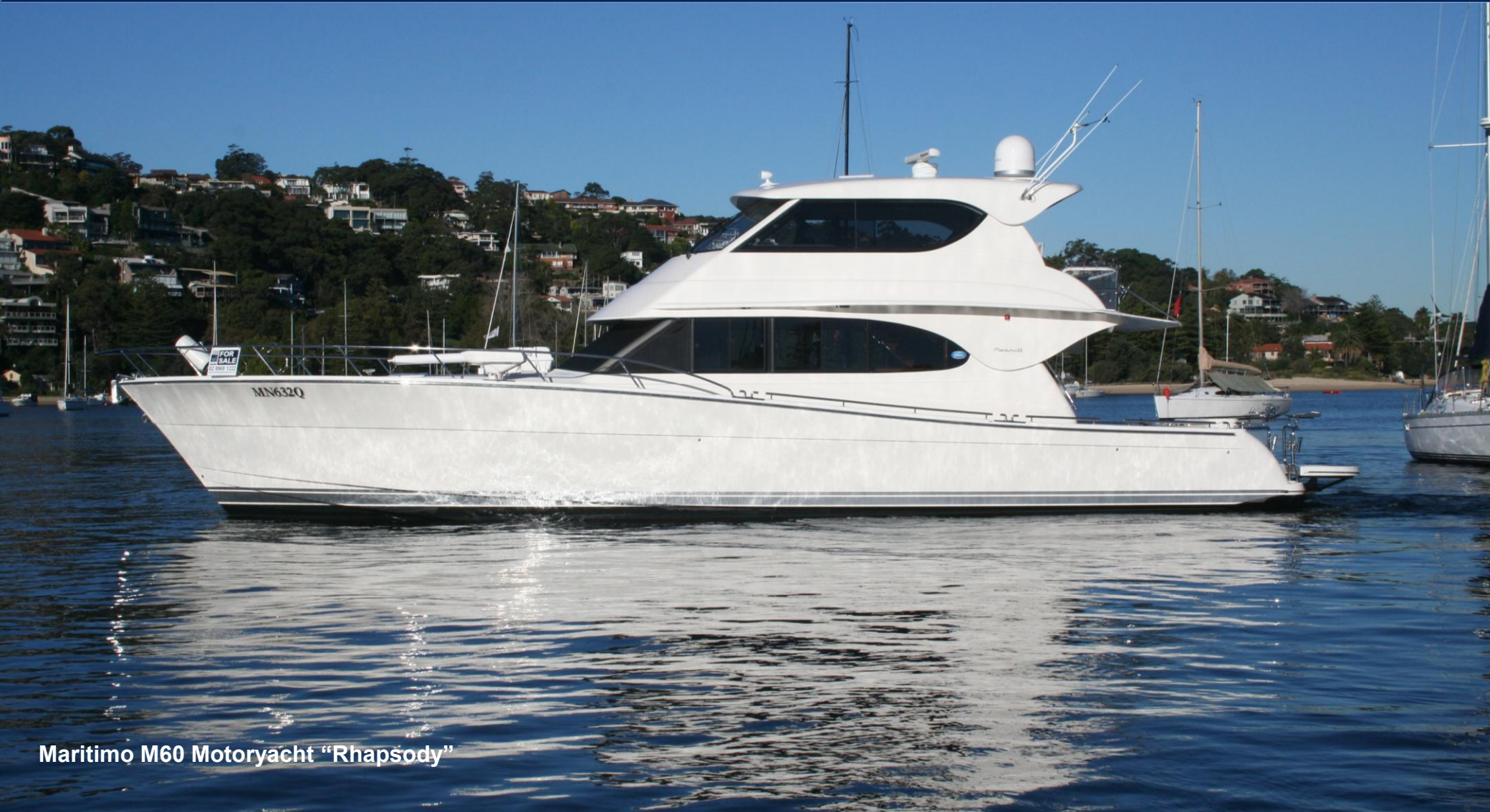
Maritimo M60 Motoryacht "Rhapsody"