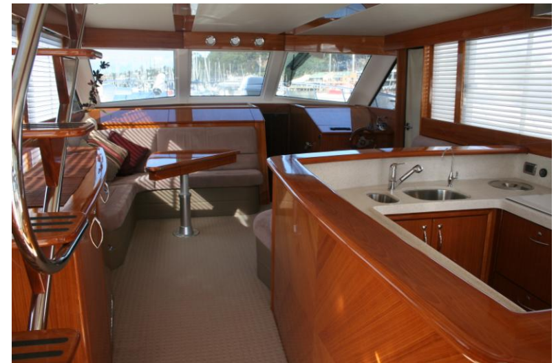
Practical and comfortable layout - underway or on anchor.